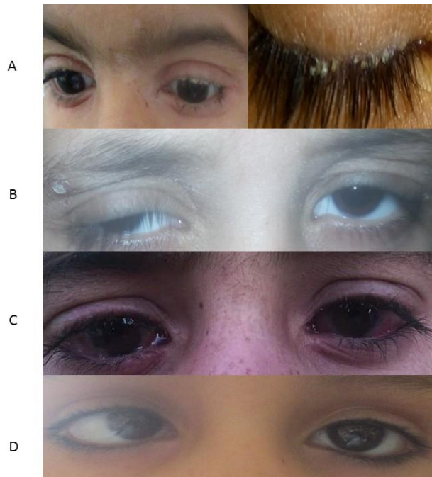
Figure 1: Eyes of school-going children showing different conditions of ocular morbidity

A) Ocular disease, Blepharitis was observed in the eyes of a child age 7 years. B) shows a child with ptosis, where the upper lid of a right eye is dropping. C) Right and left eyes showing early and late stage of vernal keratoconjunctivitis (VKV). D) Right eye of child showing Esotropia (Strabismus)