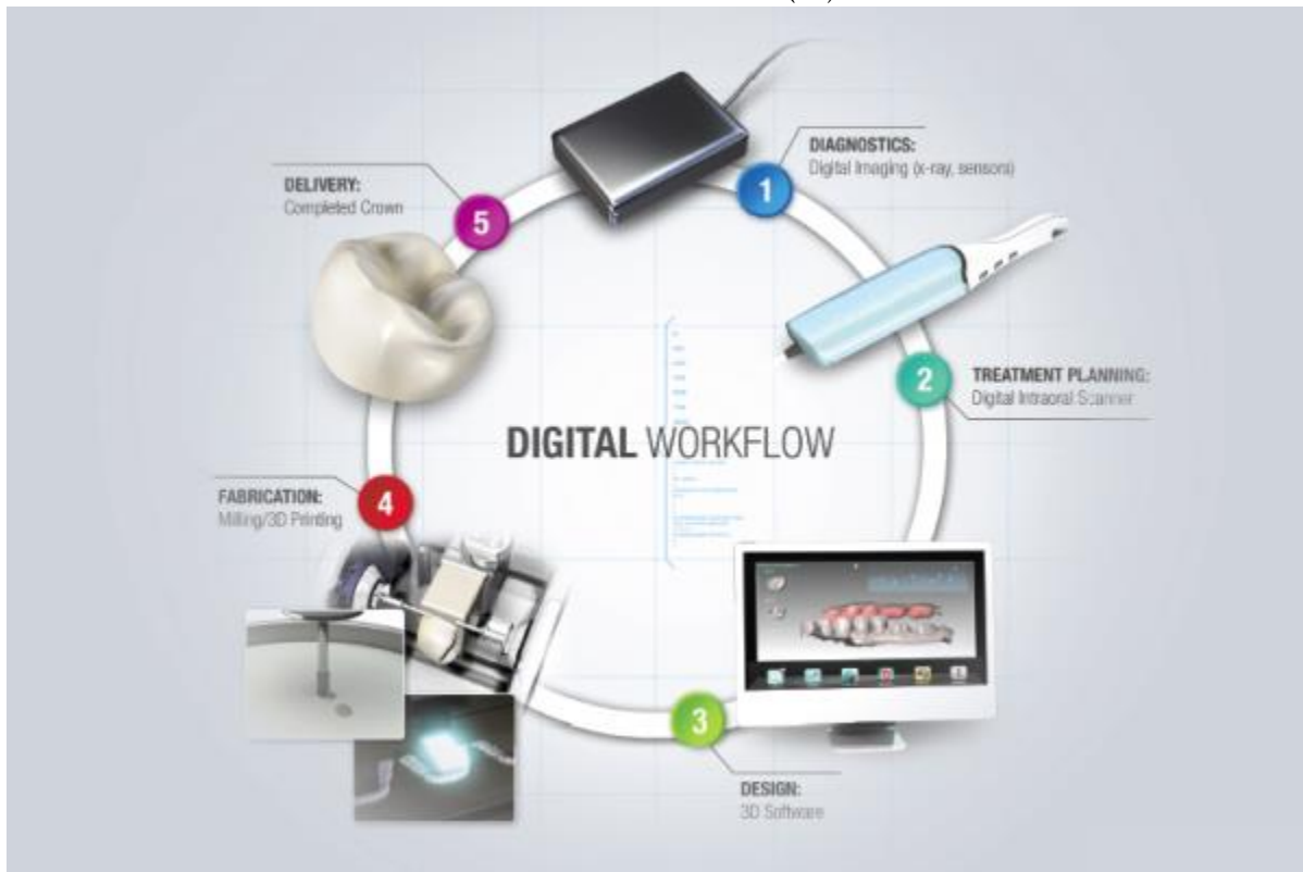
Figure 1. All-Digital Workflow for Enhanced Care: Precision, Comfort, and Effortless Treatment at Green Apple Dental in Surrey (Green Apple Dental. (2024))

With the adoption of AI in digital dentistry, there has been easy integration of diagnostic instruments into the standard clinical practices. Dental imaging systems can be integrated with AI-based software, which will be able to analyze radiographs real-time and provide feedback to clinicians (53). This combination improves efficiency, decreases diagnostic time and assists in decision-making when a patient has consulted a physician (54). Moreover, AI systems can be integrated with electronic health records and digital treatment planning tools to formulate holistic and data-driven clinical settings (55). With the ongoing development of digital dentistry, the field of AI application in improving the precision of diagnoses and optimizing workflow is to grow, no doubt, further (56).